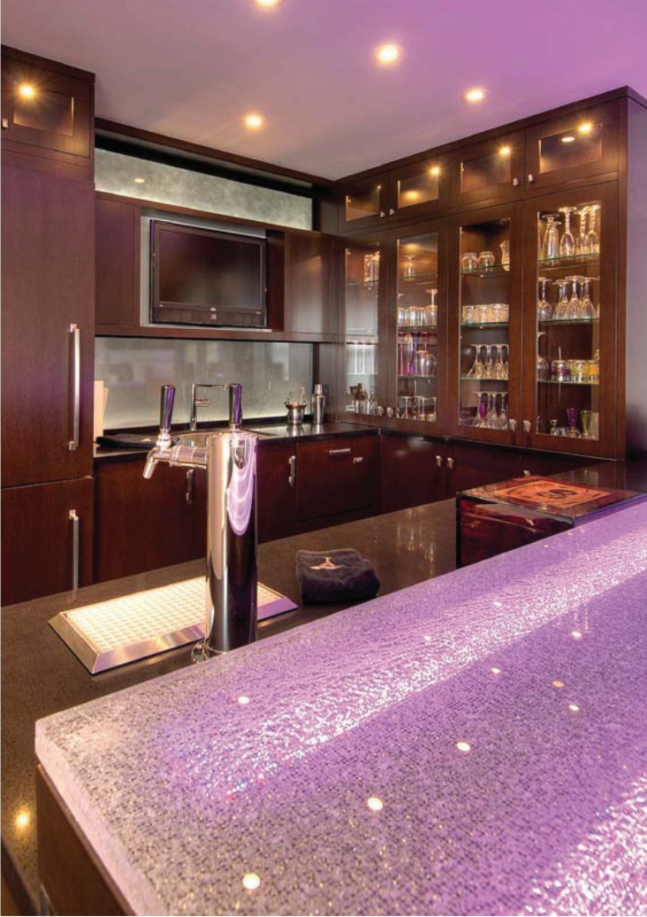
The gym, cigar room, home theatre, bar and games room are all on the lower level. The bar is topped with three layers of crushed diamond glass, which lights up in an array of colours.

“The kids left and we decided to have what we want,” she says with a grin. Mission accomplished – down to the last Sharon-inspired detail. OH